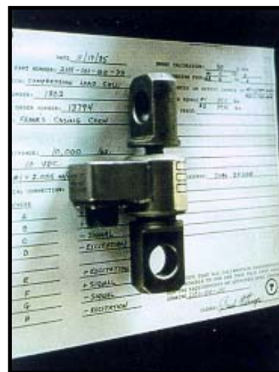
Custom Manufactured Load Cells

Tong RPM is monitored in real time and recorded for each make-up. RPM data is displayed in RPM vs Turns graph that easily correlates to the make-up graph