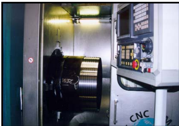
Threading of DDS Pin

In order to achieve higher connector strength Frank's cuts the threads on X-70 grade material. This gives the customer the option of using grade B pipe and ensuring higher connector strength.