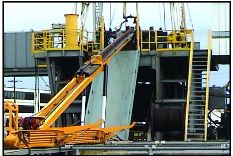
Catwalk Laydown Machine Extended

Machine can be remotely controlled from the rig floor to provide view of entire machine by the operator.